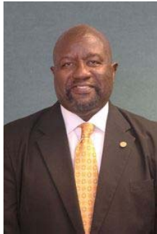
Sherman P. Lea, Mayor