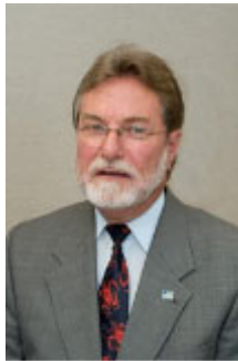
William D. Bestpitch Council