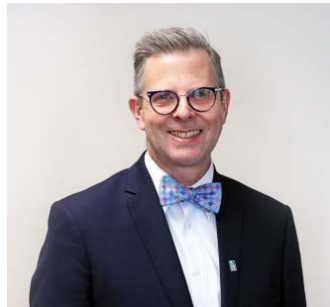
Joseph L. Cobb Council