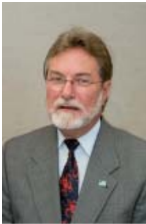
William D. Bestpitch Council