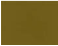
Br:9 Dark Yellow/ Brown