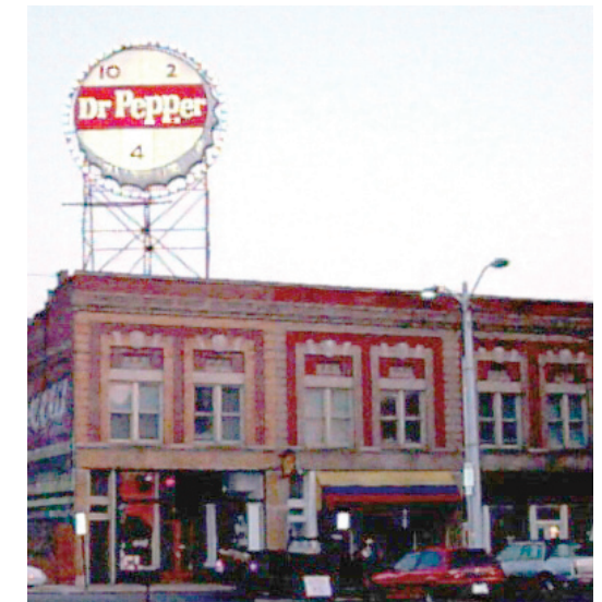
Public art comes in many forms.