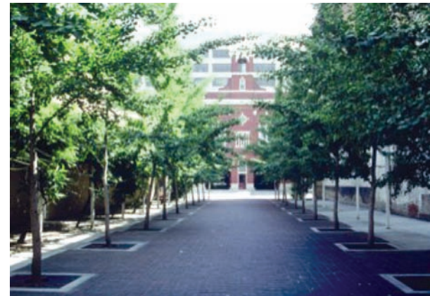
Kirk Alley could become a special intimate arts enclave.