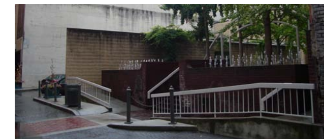
Existing handicap ramp and stairs into the plaza could become more graceful as small, full length steps that also serve as seating.