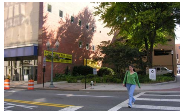
The small pocket park at the corner of Jefferson Street and Kirk Alley should be more of an urban plaza where people can gather.