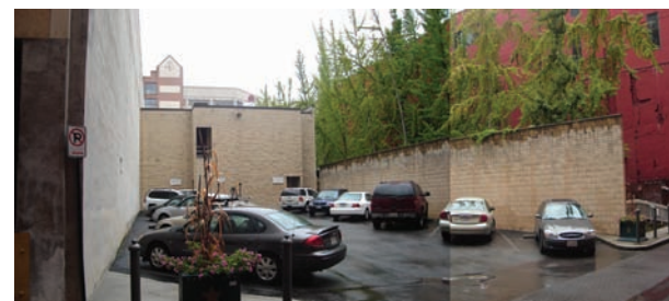
If the large wall was taken out, the parking lot could be converted into an extension of the plaza and become an outdoor seating lawn to watch movies projected on the side of the building.